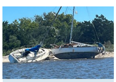
Beached sailboats off Jekyll

The Golden Isles fared well through our first Hurricane/Tropical Storm of the 2022 season, as lan slid right by us far offshore. We were all so fortunate! Although we arrived at Morningstar on Sunday to find we had to spend an hour cleaning out a trash bag full of debris that had blown into our boat while up on the rack, and to hear tales of four-foot waves rocking the in-water boats and swamping the new floating Jet Docks. We did see two less fortunate sailboats off Jekyll that day.