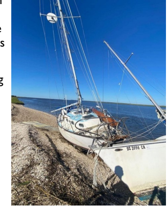
Boats aground south of Jekyll harbor marina after lan.